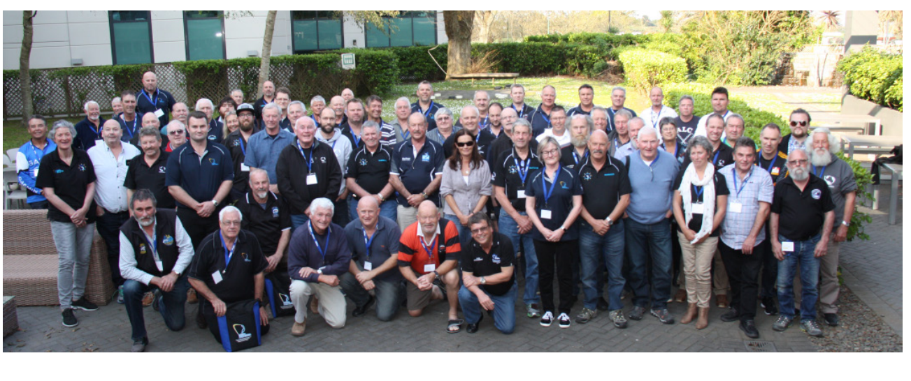
hosted by Zone 2 Auckland.