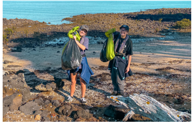
Sea Cleaners working in Mansion House Bay.

We are all about ensuring abundant fisheries in New Zealand but we also need to make sure the fish have a healthy environment. We teamed up with Sea Cleaners for our first dive clean up in Mansion House Bay, Kawau Island. It was a successful day for our volunteer divers and although finding no rubbish would've been a better outcome, we managed to retrieve around two cubic metres of litter from the bay.