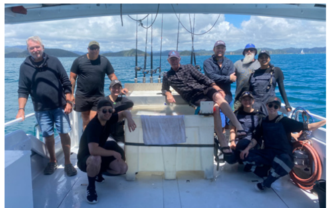
NIWA trip in the Bay of Islands.

To support the Hauraki Gulf Alliance campaign we have set up a semi-permanent campaign stand at Kelly Tarltons to continue raising awareness around bottom contact fishing methods within the Hauraki Gulf Marine Park. Our volunteers have been an integral part of the support engagement in this space and will maintain their presence at this stand over the summer holidays.