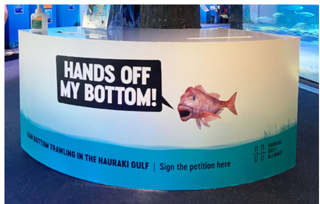
Hauraki Gulf Alliance stand at Kelly Tarltons.