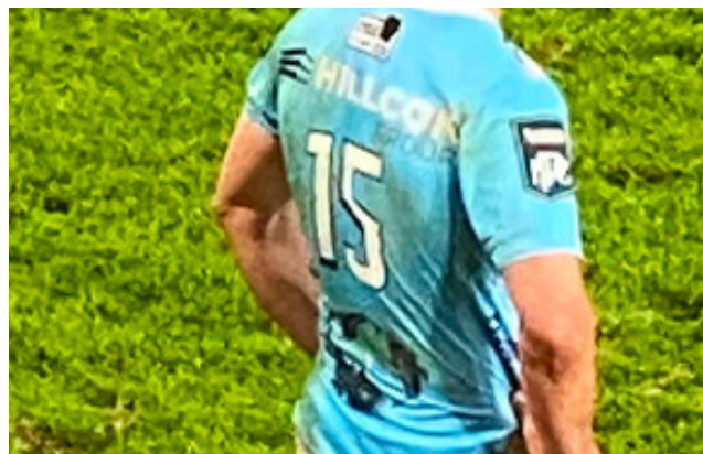
The Northland Taniwha Rugby jersey.

Please contact us if you wish to join our growing list of outstanding contributors.