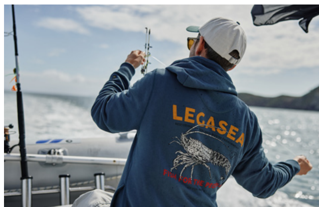
One of the new LegaSea Barkers designs in action.