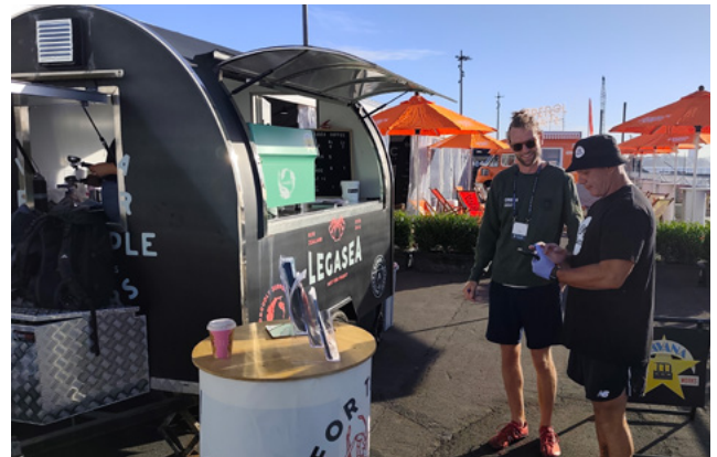
The LegaSea Coffee Cart in action

LegaSea launched and tested its coffee cart as a new way to fundraise and engage the public in conversations about marine protection. We hope to connect with the public over coffee while discussing LegaSea's work and the importance of sustainable fisheries. Across the quarter, we operated at a range of events, including the Sail GP, Auckland Boat Show, Wooden Boat Festival as well as the OBCs annual fishing comp and the Manukau SFCs Westcoaster. Event sponsored site rental and partnerships with Havana Coffee Works and Boring Oat Milk, meant we have had the opportunity to trial the model with upfront costs and minimal risk. Early results show strong potential for the coffee cart to become both a meaningful revenue stream and a powerful outreach tool.