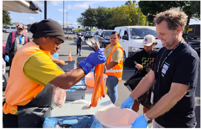
Fish distribution at Papatūānuku Kōkiri Marae

Fish distribution in Auckland, delivered in collaboration with Papatūānuku Kōkiri Marae, paused over the Christmas period before resuming in February to strong demand. This highlighted the ongoing need for the programme and the importance of maintaining a consistent supply. During the quarter, Kai Ika also hosted the Tātaki Auckland Unlimited team, who support the project through the collection of aluminium cans from venues such as the Aotea Centre and Town Hall.